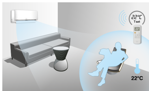
"Follow me" function in cooling mode