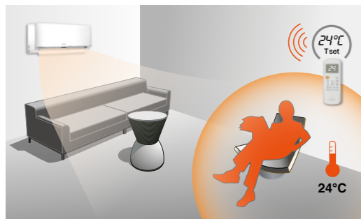
"Follow me" function in heating mode